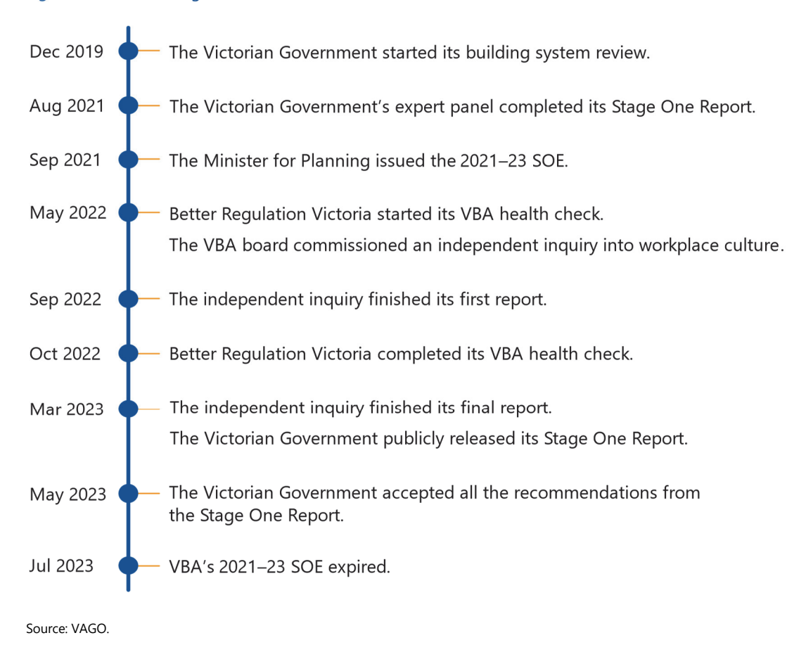
Figure 2: Events relating to the recent reviews that involved VBA

Figure 2 shows a timeline of events relating to the recent reviews that involved VBA.