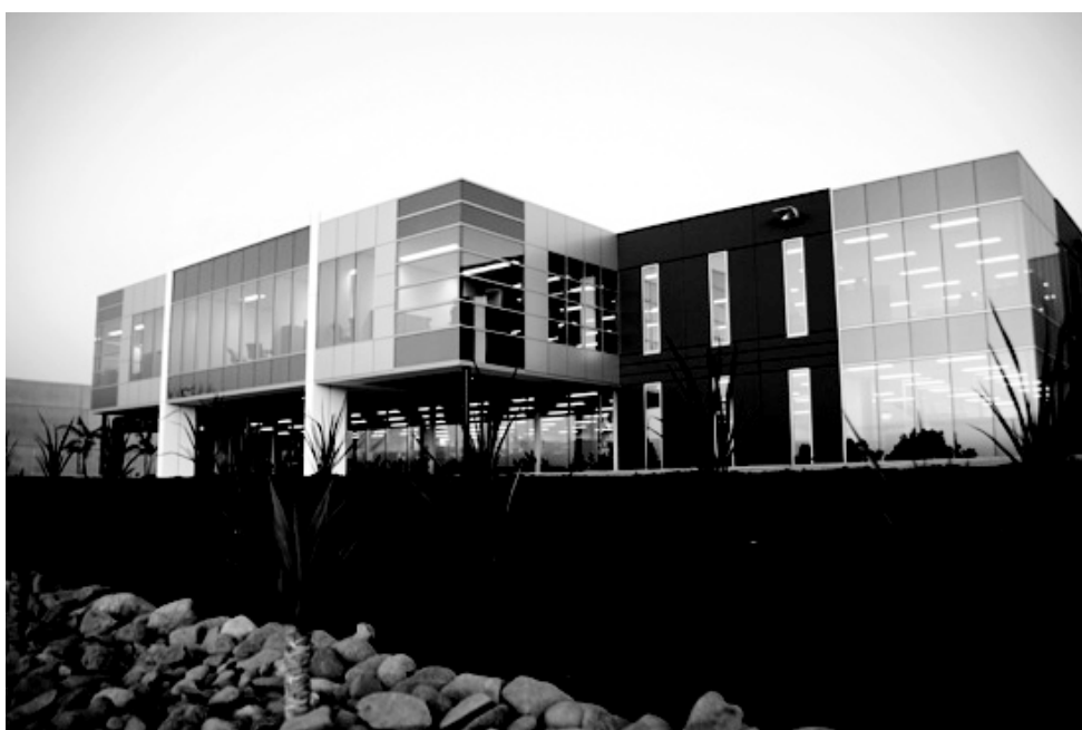
Utility Services depot office at Lynbrook

For each capital works project, 'us' – Utility Services prices the above two options and makes a recommendation to SEW, which may carry out further investigations before choosing an option for 'us' – Utility Services to implement. If the project is completed for less than the target cost, the 'gain' is shared equally between SEW and the consortium. If it is completed for more than the target cost, the 'pain' is also shared equally. The consortium's 'pain' is capped at the amount of its margin.