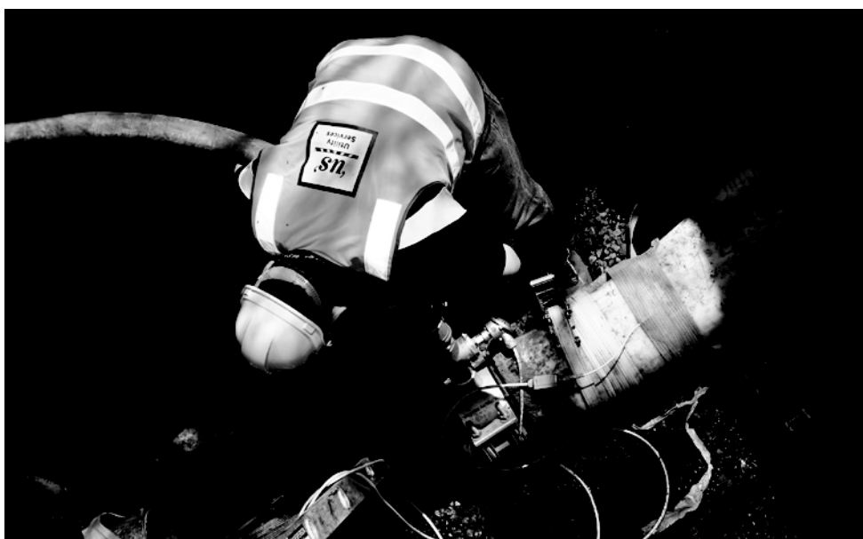
Top image: Flexible coiled pipe is ready to be dragged through an unserviceable rising main. Lower image: The pipe has been dragged through the old main. A 'us' – Utility Services worker is making it ready to be pressure-filled with steam from the boiler unit (top, above). This reinstates the pipe to its circular shape within the old main. This method is far quicker and cheaper than digging up the old main and replacing it, and compact pipe is as strong as standard plastic main.