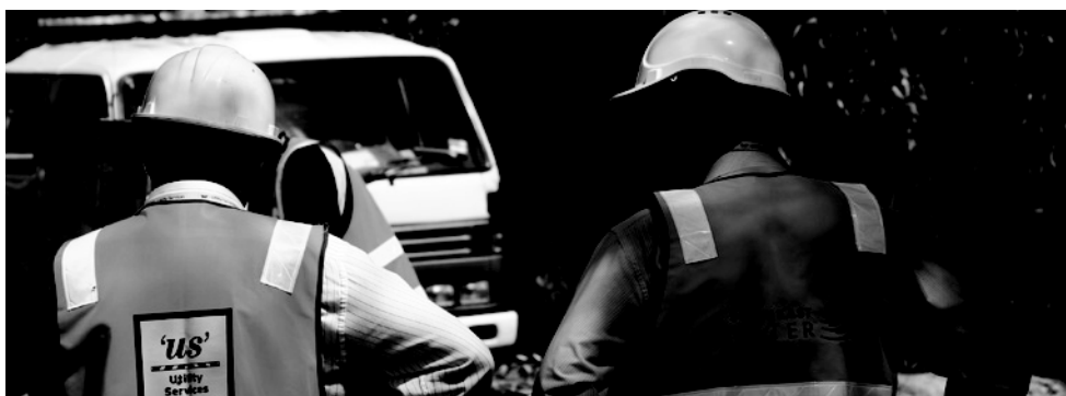
'us' – Utility Services staff—employees of SEW or the consortium members—work alongside SEW representatives in the field to maximise efficiencies and meet service targets.

Management estimated redundancy payments to be $800 000. They were actually $1 127 000. Management expected one-off costs for legal and consulting services, advertising, training and other establishment costs for the alliance to be $500 000. They were finalised at $395 000.