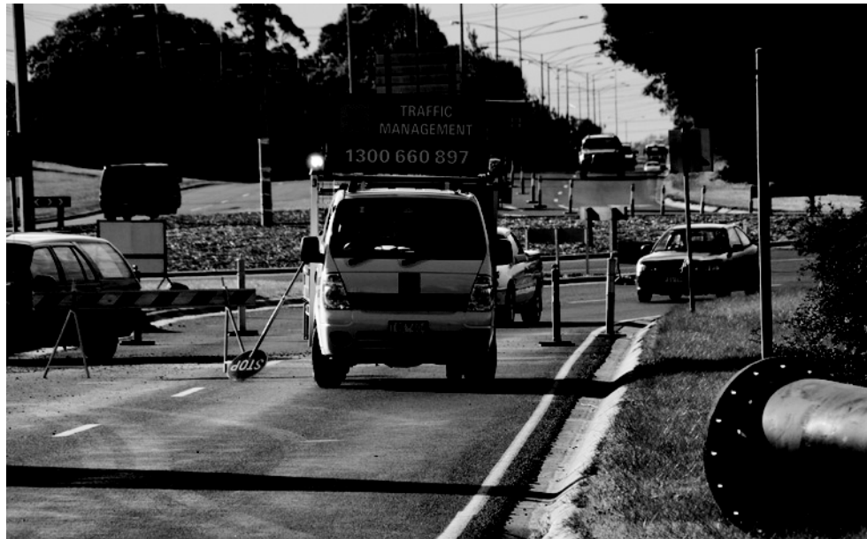
Traffic management is a significant component of external works undertaken by Utility Services.

SEW, through 'us' – Utility Services management, has been thorough in identifying and mitigating the risks of external works.